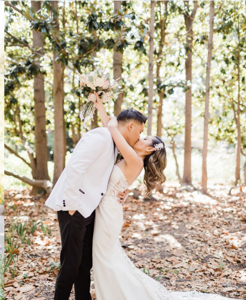
caption for image will go right here - placeholder